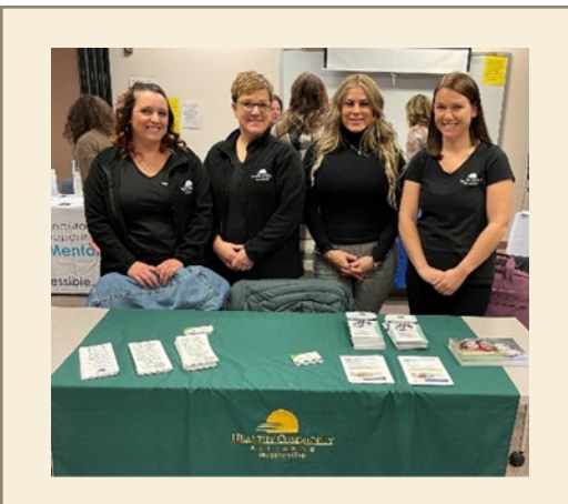
HCA staff provided information on universal screening and critical programs and services during the "Connecting the Dots" networking event at Jamestown Community College this past January.

Department of Health and other PICHC grantees on best practices to engage those most impacted by social determinants of health and who are residing in underserved areas with limited services, such as our rural communities. Throughout the